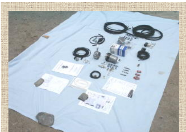
all the kit required for an Elsbett conversion of a Citroen ZX.

In the budget of 2002, the road duty for