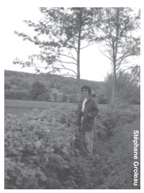
Hedge at Hardwicke provides a good habitat for wildlife