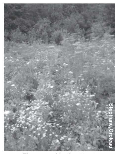
Flowers and herbs attract pollinators and predators

For a supply of early nectar, try planting some aubretia, primulas or polyanthus. Bumblebees that have just come out of hibernation will visit these plants. The bright yellow, St John's wort is extremely attractive to bees and makes a good ground-cover plant, although it can be invasive and rather difficult to get rid of. Sunflowers are good fun to grow and popular with both bees and children. Many types of marigolds are attractive to bees, including the variety of French marigold called 'Naughty Marietta',