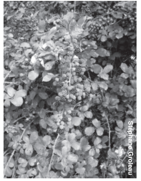
Fruits in the hedge provide food source for birds

The red mason bee is an excellent pollinator of fruit crops, many garden flowers and vegetables and is therefore of immense value to the vegan-organic gardener. And because this bee does not store honey in its nests and therefore does not have huge resources to defend, it tends to be very docile, making it quite safe with children and pets. But as well as its non-aggressive nature, the red mason bee has several other advantages over the honeybee as a managed pollinator. First of all it can fly at lower temperatures than the honeybee and visits far more flowers and trees in a given time. Secondly, it grooms itself more inefficiently and so when it visits another flower the chances of pollination occurring are that much higher. Finally, its period of peak activity coincides with the flowering of all the major orchard fruits. If you attract these