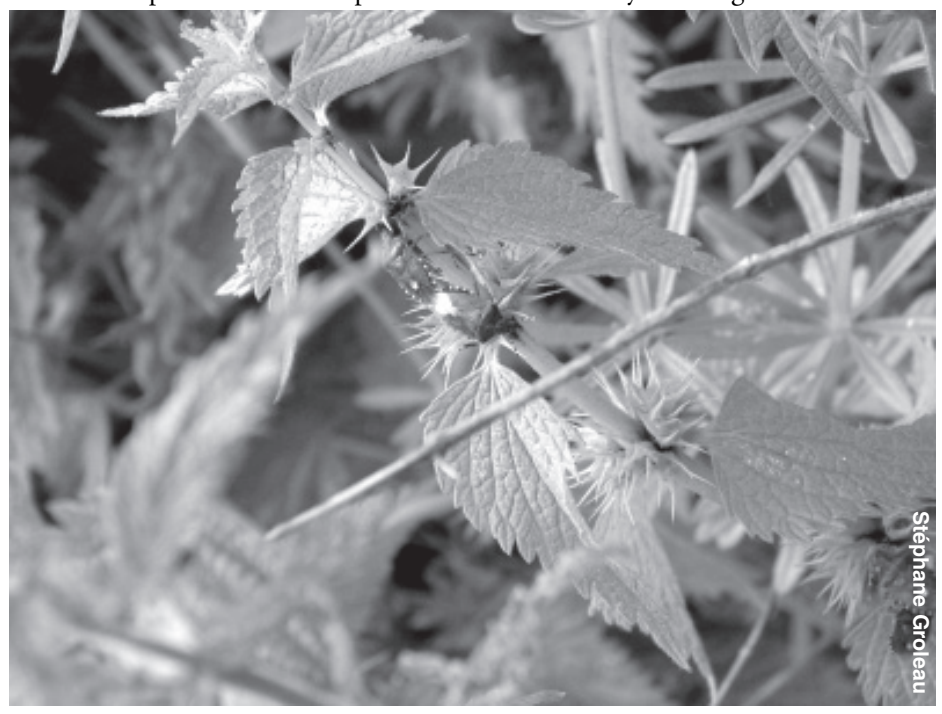
Stinging nettles are a great habitat for beetles

So as you can see, if you have enough room it is well worth including a hedge in your garden. But as well as the larger hedging plants mentioned above, you could grow many kinds of wild flowers underneath your hedge in order to at-