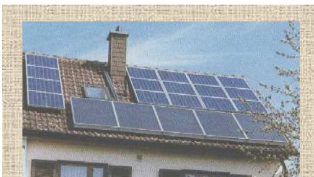
roof in Germany with 16 80-watt photovoltaic panels, which will generate around 1000kWhours of electricity per year – about one third of a family's needs. There are also 5 solar hot water panels at the bottom of the roof, which do not produce electricity – water passes through them and is heated directly.

Large-scale use of lead-acid batteries would cause environmental problems in their manufacture and disposal, so connection to the grid would be better unless in a remote location.