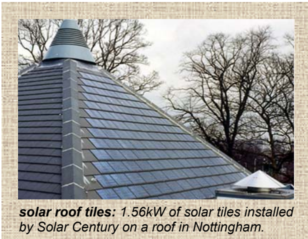
solar roof tiles: 1.56kW of solar tiles installed by Solar Century on a roof in Nottingham.