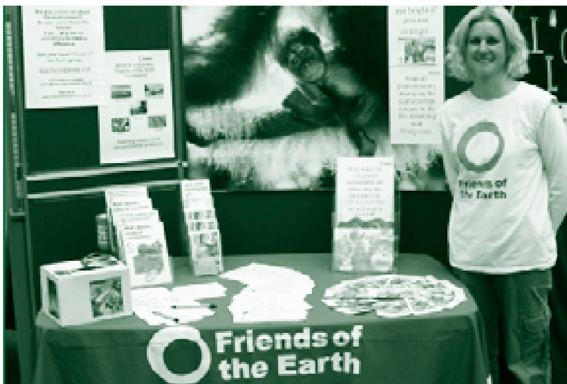
South Cheshire Friends of the Earth

When your group last ran a stall, how much time did you spend in advance talking it through and planning it? For most groups the answer is probably "not a lot" and yet a stall is the public face of your group, a route to new members and the first place that members of the public take action on our campaigns. So it's worth a bit of time getting it just right. Follow the simple steps in this pull-out guide and you could enter a whole new world of successful street campaigning.