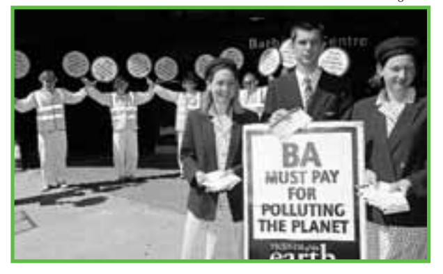
FOE protests outside British Airway's AGM.