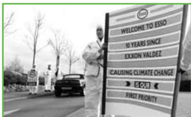
Climate culprits: choose the right targets.

Clearly, it wouldn't make sense for FOE to criticise every corporation every time they did something campaigners disagreed with. That's why FOE uses the best of sector and worst of sector concepts to help select corporate targets. The oil and gas sector, for example, is one which is inherently unsustainable. But even within this, it is possible to identify some oil companies as being even more intransigent and arrogant than others (eg, Exxon, which still has to accept the reality of climate change).