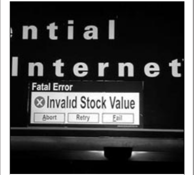
"Abort, retry, fail", one of a series of BLF improvements to dotcom adverts, November 2000.

During the action, if you are spotted by passers-by, it may pay to have your ground crew approach them rather than just hoping they do not call the police. Do not let them associate you with a vehicle.